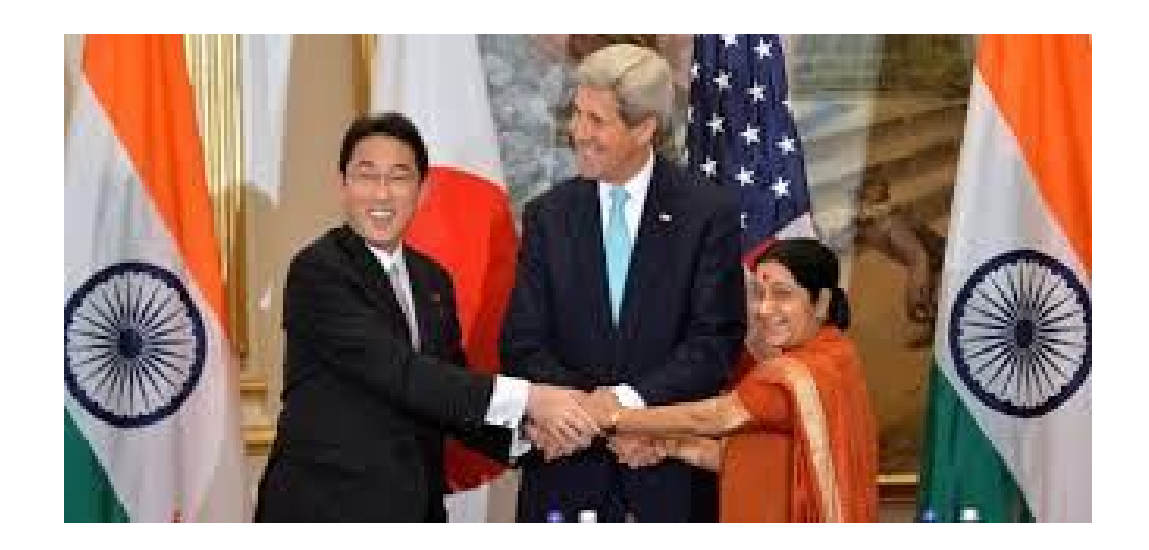
India - Wiesbaden Conference 2018 (April 16 -17, 2018)

All sides agreed to remain engaged and strengthen cooperation in support for a free, open, prosperous, peaceful and inclusive Indo-Pacific region through partnership with countries in the region.